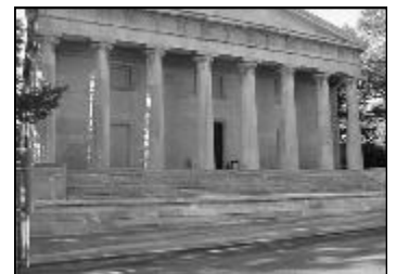
The bank's main branch still stands in Philadelphia.

All nations need money to carry out their business, and the United States was no different. To make it easier for the government to do business, in 1816 Congress passed a law creating a national bank. The Bank of the United States was just like any other bank, except it was where the federal government did its banking business. In those days, state banks issued bank notes that functioned like money. The Bank of the U.S. was also allowed to issue bank notes. In exchange for this special treatment, it agreed to loan money to the U.S. government.