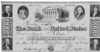
A $3,000 bank note

Once the bank was established, it opened branches in different states. One branch was located in Baltimore, Maryland. The U.S. government didn't ask Maryland for permission—it just opened the branch and started doing business. Maryland's state banks weren't very happy about having a new competitor in town where people could do their banking. And they didn't