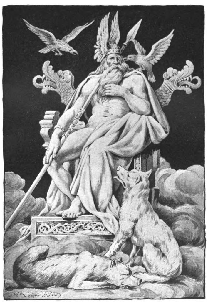
Odin on his Lofty Throne.