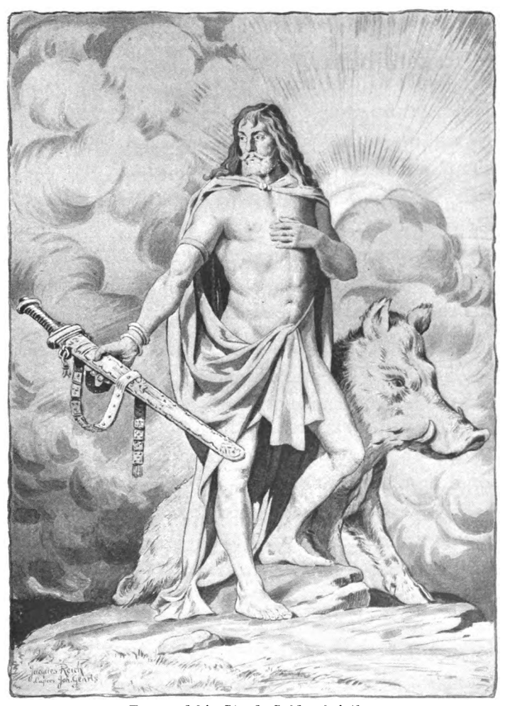
Frey and his Steed, Golden-bristle.