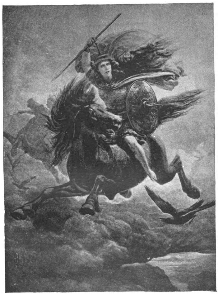
Gudrun the Valkyrie.