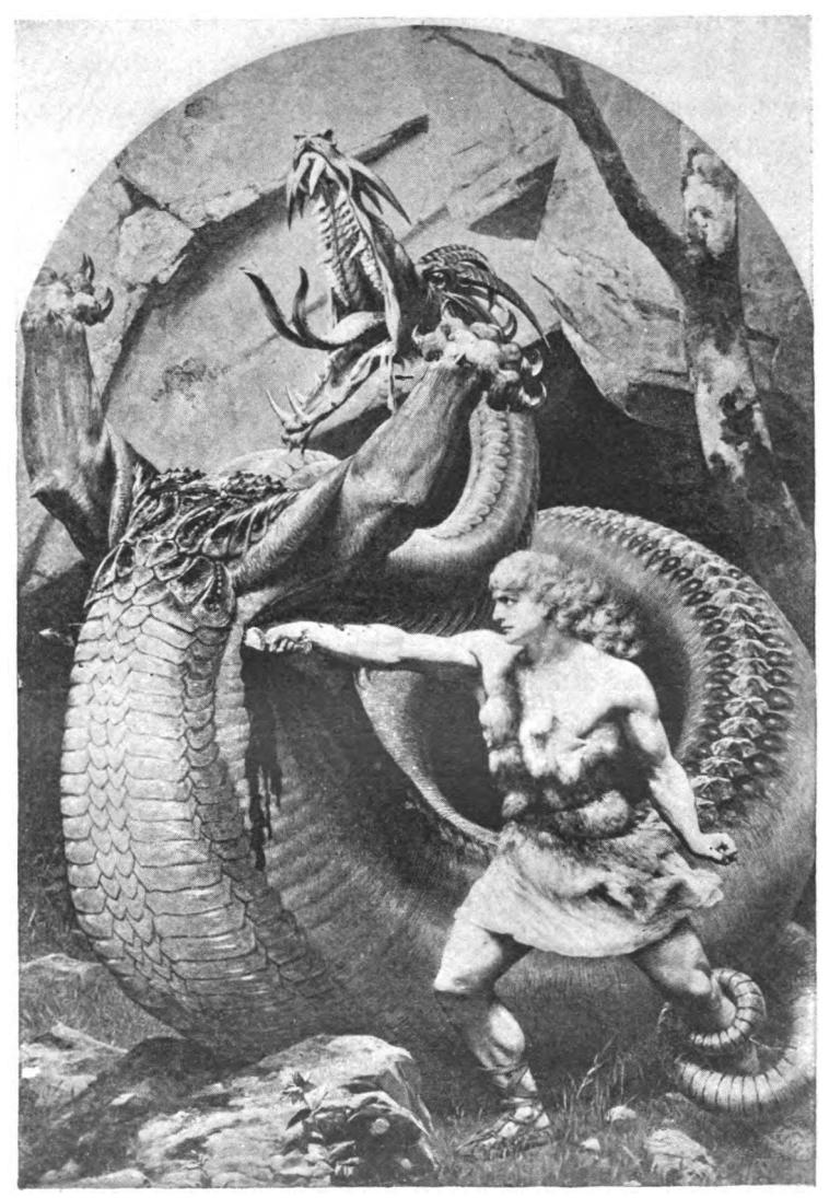
Sigurd Slaying the Dragon.