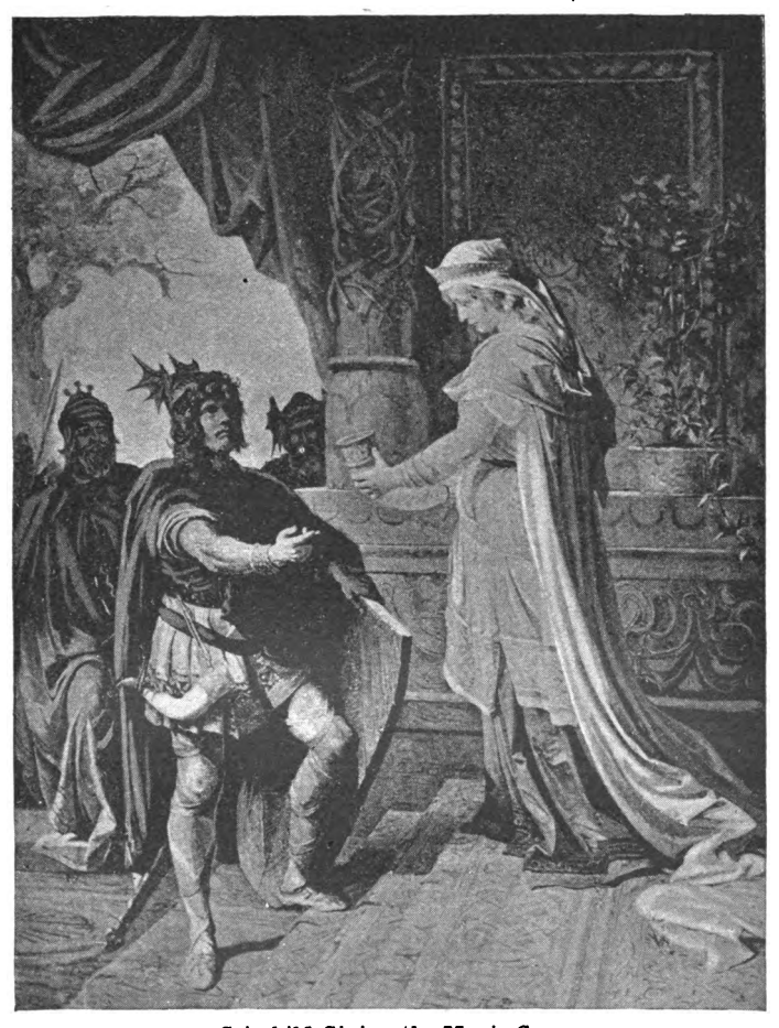
Grimhild Giving the Magic Cup.