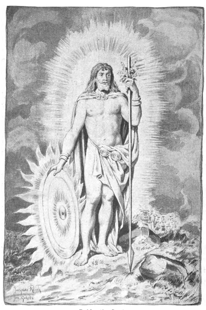
Balder the Good