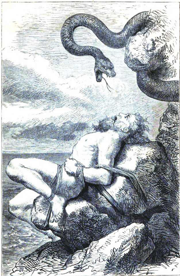
THE PUNISHMENT OF LOKI.