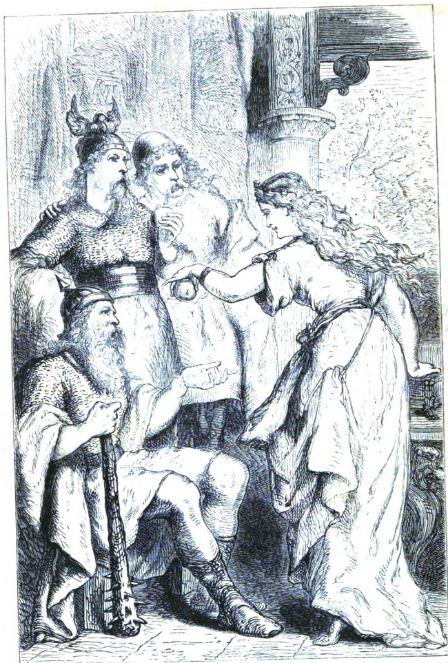
IDUNA GIVING THE MAGIC APPLES.