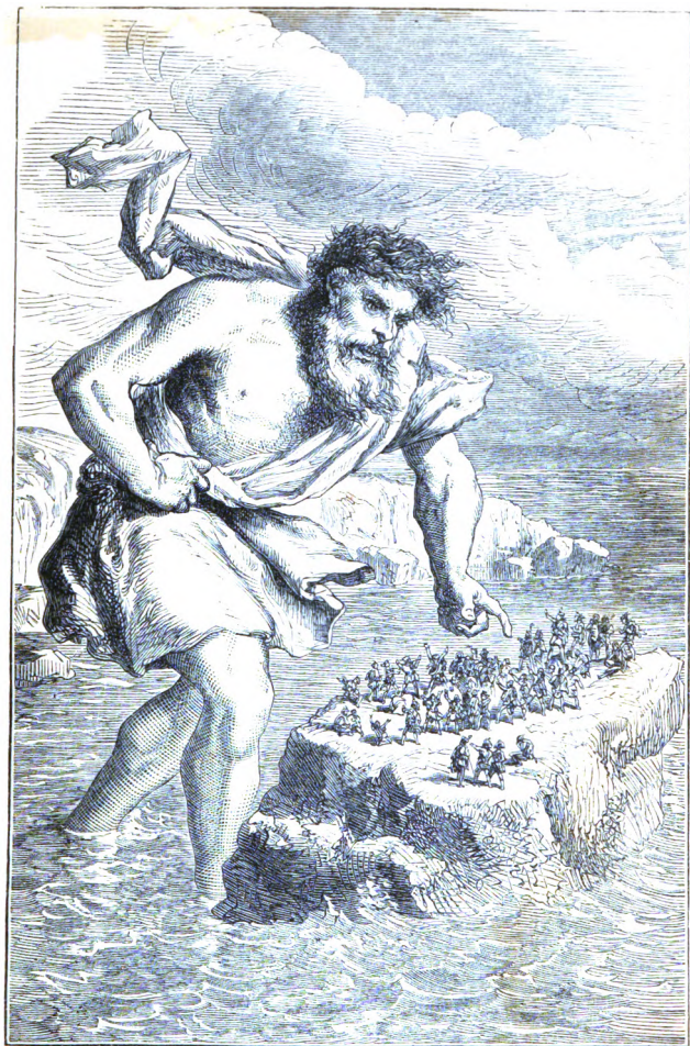
GIANT SUTTUNG AND THE DWARFS.