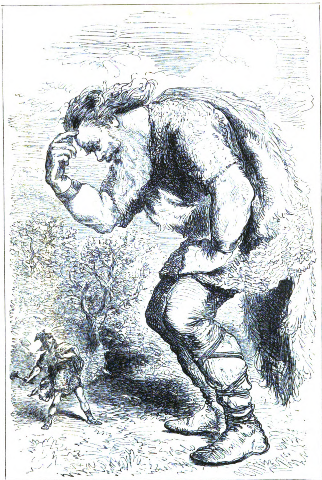
GIANT SKRYMIR AND THOR.