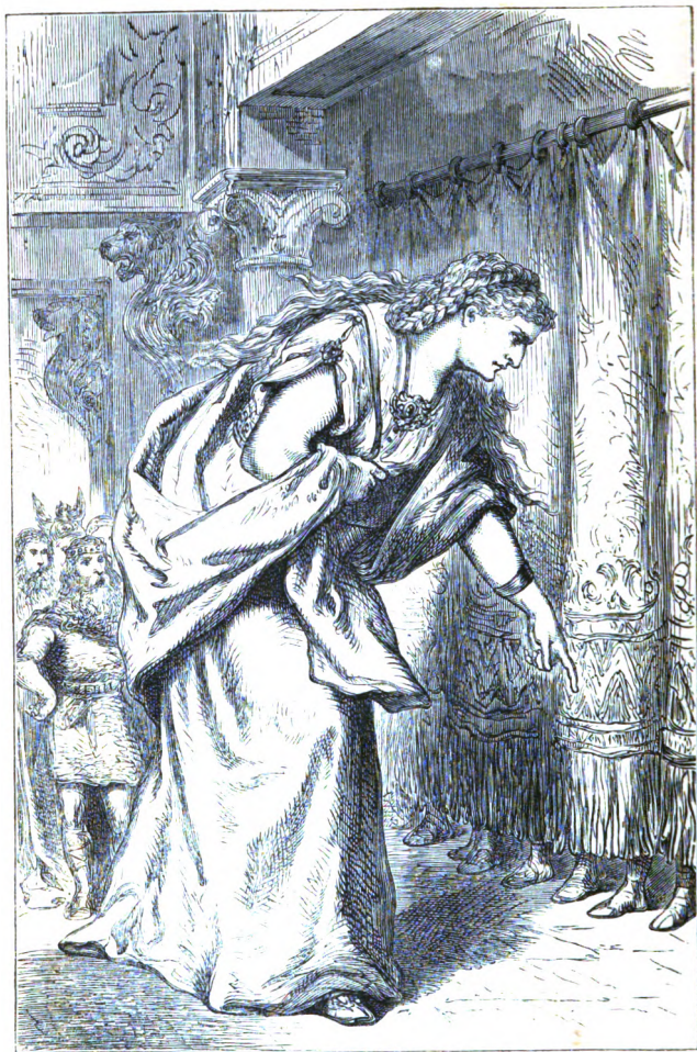
SKADI CHOOSING HER HUSBAND.