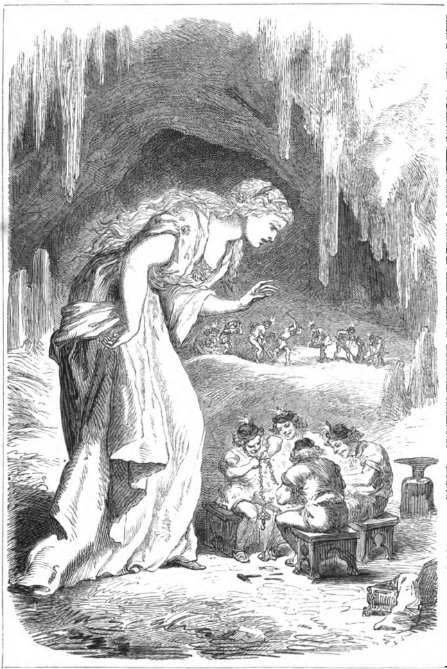
FREYJA IN THE DWARFS' CAVE.