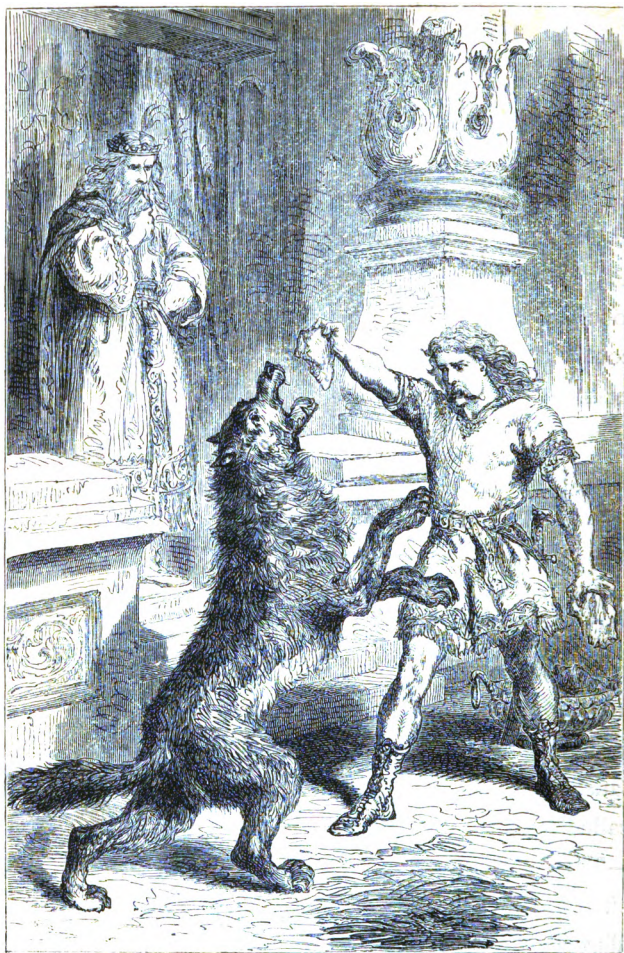
TYR FEEDING FENRIR.