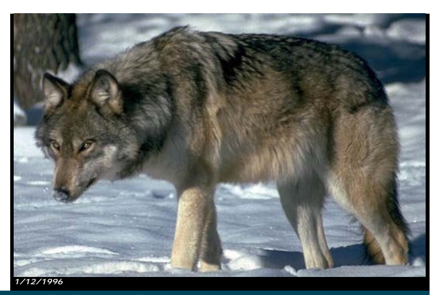
All photos are copyright protected and cannot be duplicated for any reason without the expressed written consent of the photographer. Please contact the International Wolf Center for any photo request.